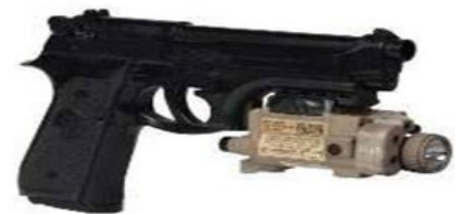
Fig 4. Pistol (weapon)

The FIREARMS data consists approximately 5000 positives with weapons and about 3000 negatives without firearms. However, we will only test it on about 500 images of each layer.