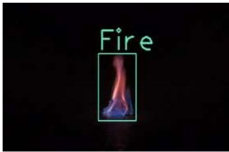
Fig 5.- Video frame with fire predictions