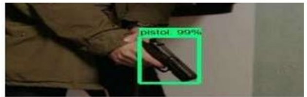
Fig 3. Prediction on an image in UGR dataset