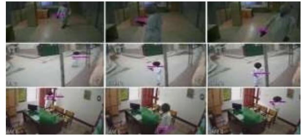
Fig 6- Cumulative Result of Detecting Weapon With Precision Value

A practice dataset was created because there was no data for weapon frames, as indicated by the CCTV view. As a result, 20 guns images have been accumulated from various locations, of which are CCTV images of individuals with guns.